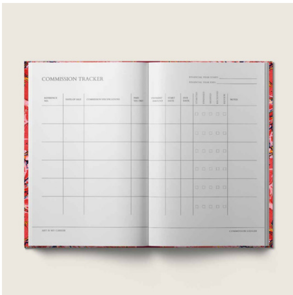
Commission Ledger for Artists

Keep track of your art commission sales and coordinate your waiting list.