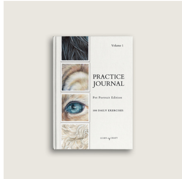
Practice Journal Pet Portrait Edition 100 Daily Exercises for Artists.